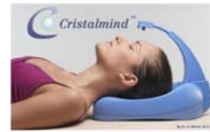
Cristalmind™ Shirodhara Equipment